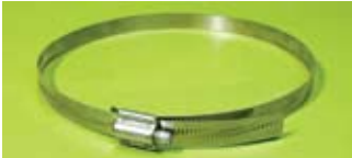
Band-It® is the registered trademark of IDEX Corp.